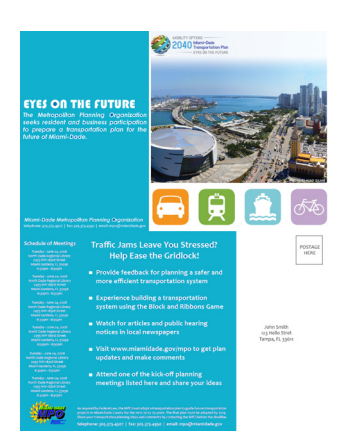
Graphical brochures capture the recipient's attention while conveying useful information concerning upcoming public meetings.